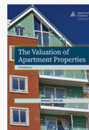
The Valuation of Apartment Properties